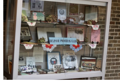
120th Anniversary Display at Bethlehem Public Library