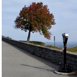
Wellness Walk at Thacher Park