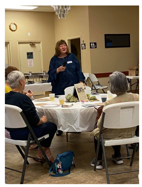
September 9, 2021 120th Anniversary Celebration